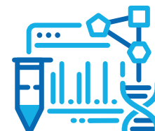
DEL Technology and Enabling Services