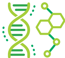
DEL Driven Hit Identification